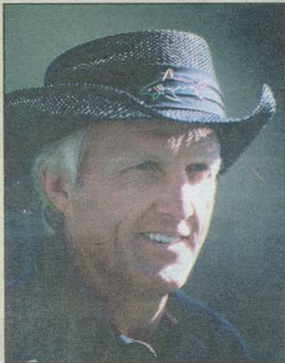
Honorary chair Greg Norman to support March 11 NOPE benefit. Page 9.